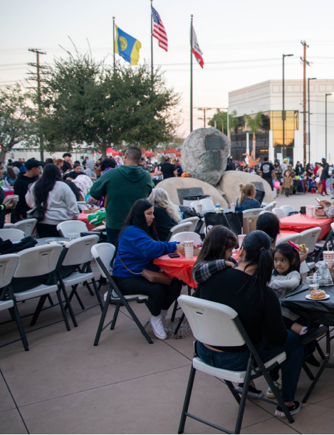
Our partner nonprofits were appreciative of the City's turkey donations.