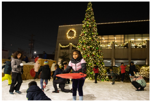
Holiday Parade December 14