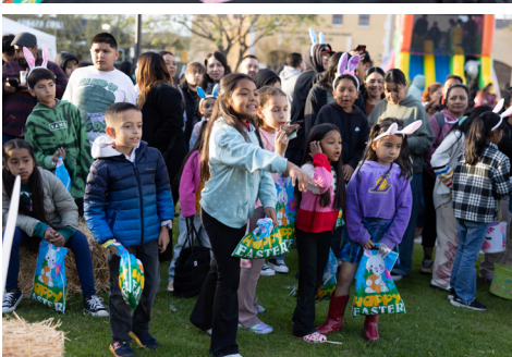
Kids plan their egg collection strategy for the City's Easter Egg Hunt.