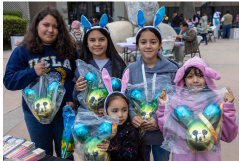
Kids pose with fun giveaways from non-profit community partner, Helping Hands.