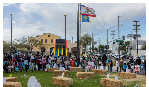
Kids get ready for the Easter Egg Hunt - who will find the "golden egg"?